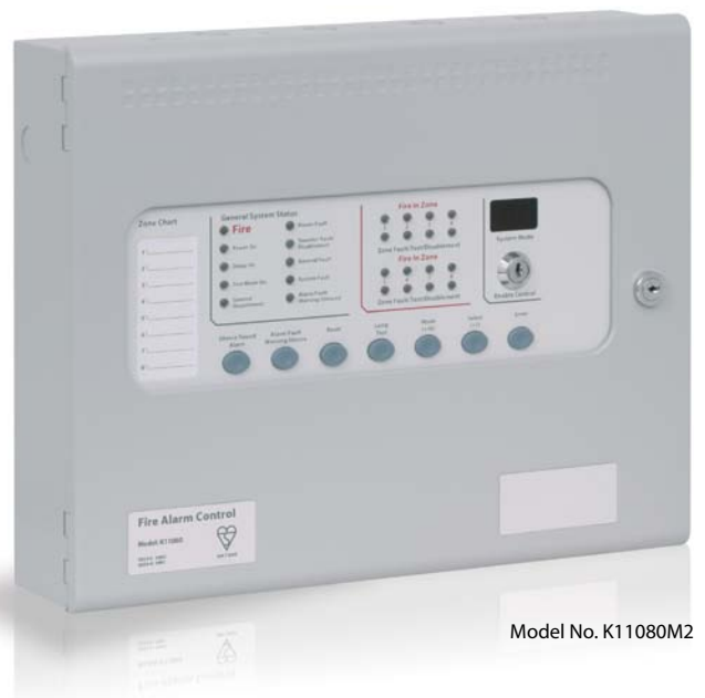
Model No. K11080M2

Note: Also available is the Sigma Sounder Board (K461) which is compatible with all Sigma CP and CP-R panels which have operating software version V3.0 or above. See DS48 (page 54) for more details.