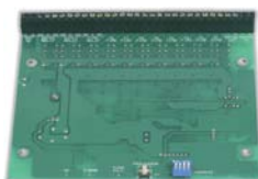
Part No. K580