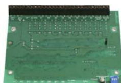
Part No. K461